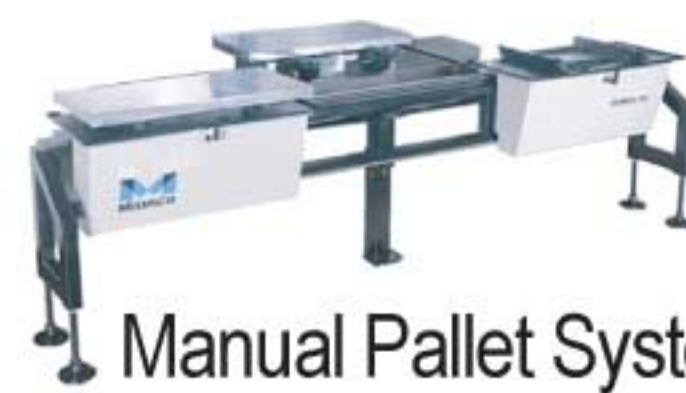
Manual Pallet System

Various pallet sizes, manual, rotary and double systems are available along with other accessories designed to meet your needs.