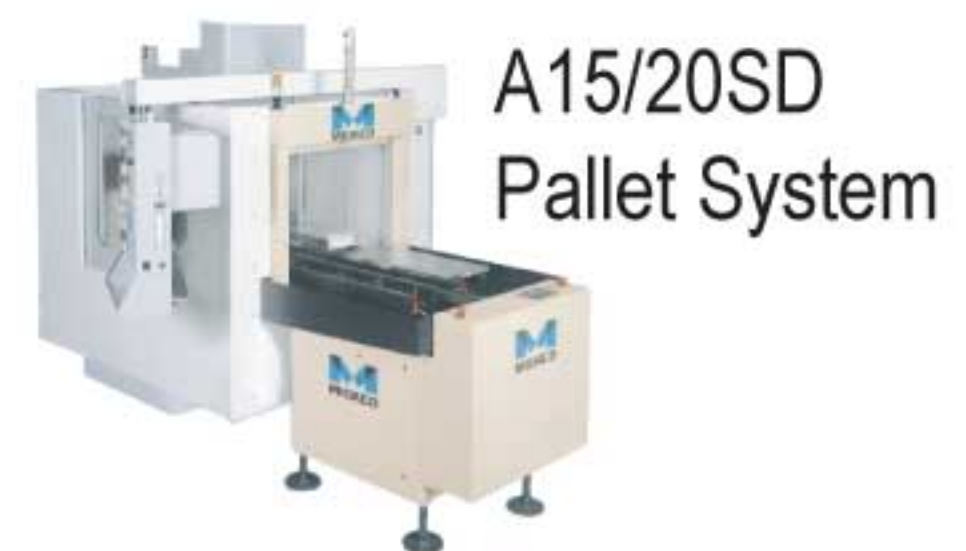
A15/20SD Pallet System