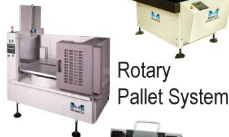
Rotary Pallet System