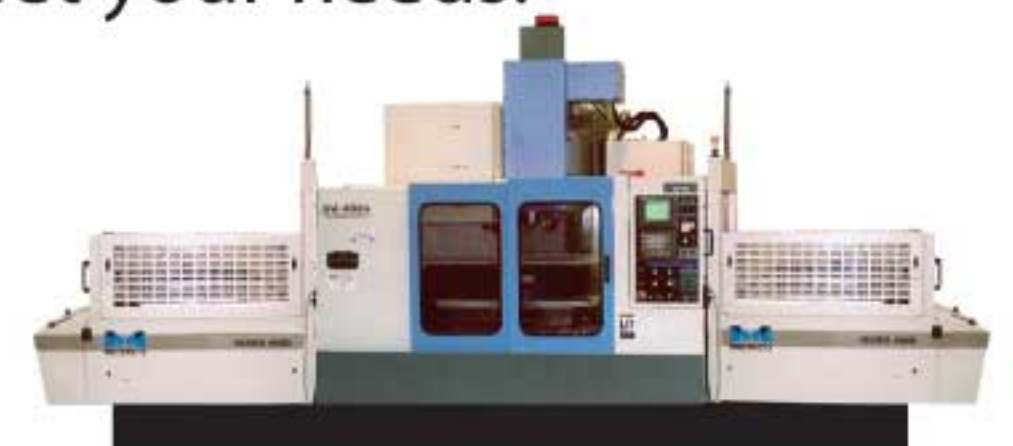
Dual Automatic System