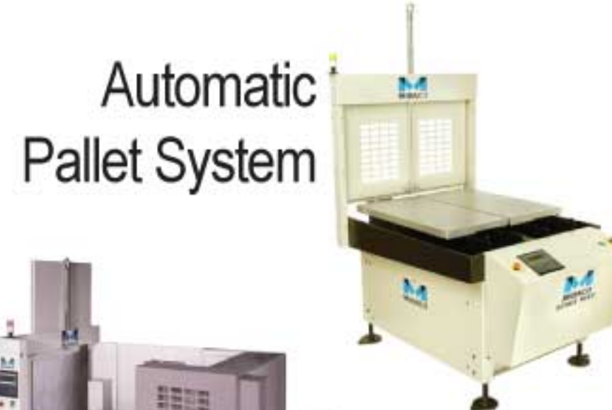
Automatic Pallet System