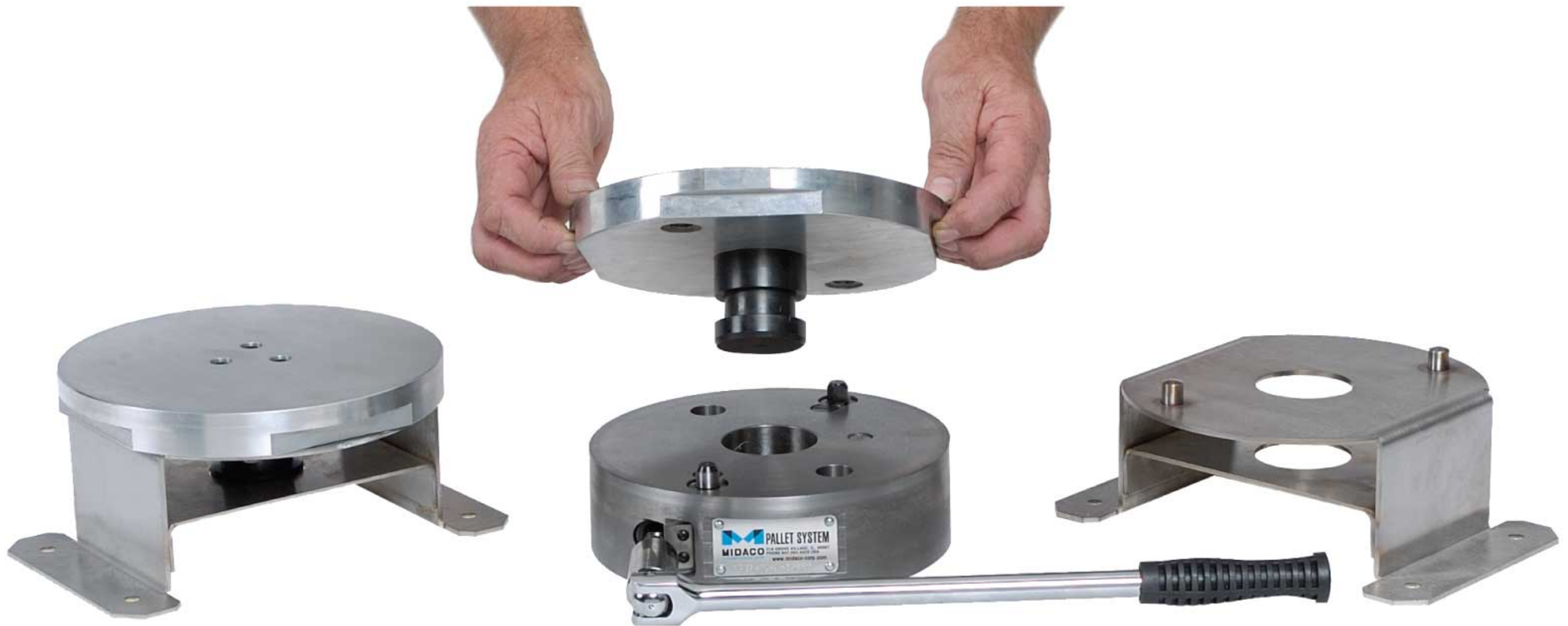
Shown with optional Pallet Holders

For 5-Axis, 4-Axis, Vertical and Turning Applications