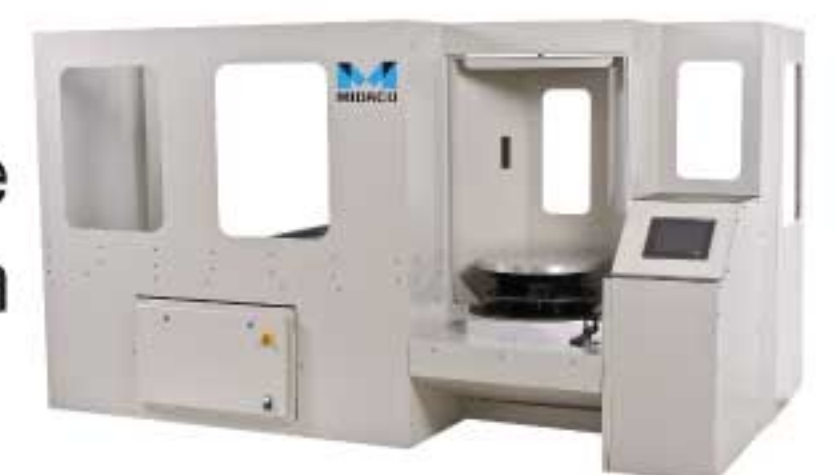
Flexible Pallet System

Since 1969, MIDACO has been a leader in providing innovative and quality solutions to improve manufacturing efficiency for companies worldwide.