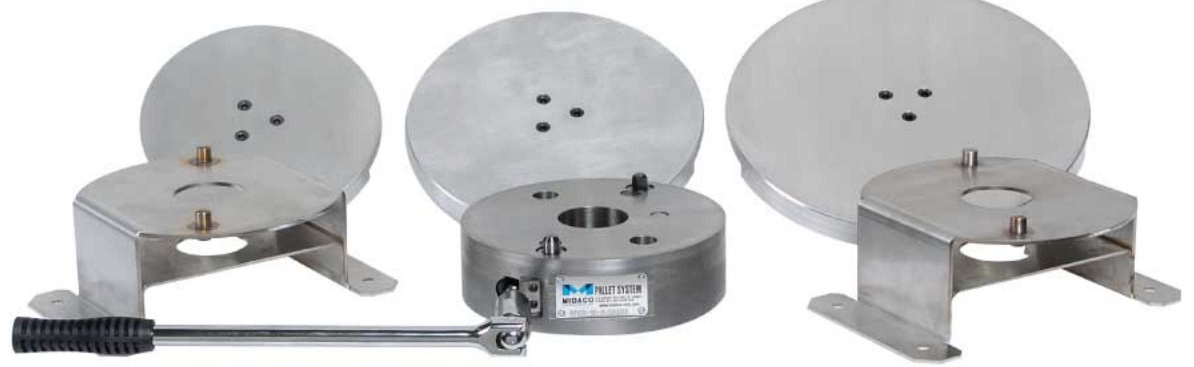
Shown with 8.5", 10" and 12" pallets and with optional pallet holders