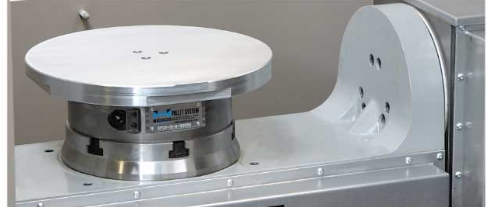
Shown with 12" pallet