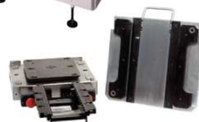
Manual "Lift Off" System